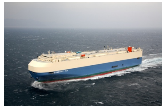
Car-carrier Sunshine Ace at sea

MOL has been transporting Mobile Library buses over years from Japan to Durban at very special freight charges since the beginning of the project.