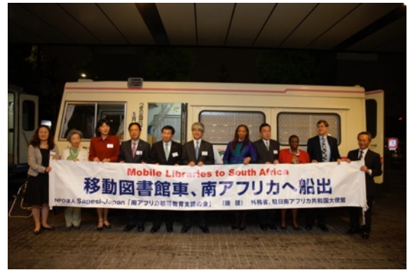
Tokyo - departure ceremony

The South African embassy in Tokyo and SAPESI Japan organized a departure ceremony on May 22 2014 in the embassy. This was, at the same time, in commemoration of 20 years of democracy in South Africa. The ceremony was a great success with the presence of various VIP guests and representation by Japanese newspapers.