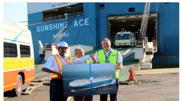
Sunshine Ace docking in Durban harbour

On June 29, the car-carrier "Sunshine Ace" of our shipping partner MOL, arrived in Durban, transporting 6 mobile libraries namely 3 for Mpumalanga DoE, one each to Free State and Gauteng DoEs, and East Rand NGO Ekufundzeni. The buses were delivered safely to their destinations after a long and laborious custom clearance process.