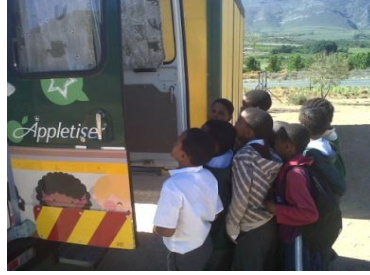
We can't wait to open those books on the shelves!