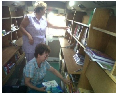
"Just what I need for my Afrikaans lesson next week"