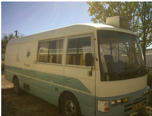
The three busses before their "New Look"

A request form which the educators fill in when they plan their assessment tasks had been designed. These forms are then submitted to the facilitators where their requests are taken into account and every effort is made to source these assessment tasks. The facilitators search for relevant books in the depot, make copies from reference resources, carry out searches on the Worldwide Web and also refer them to relevant titles in the EDULIS collection in Bellville.