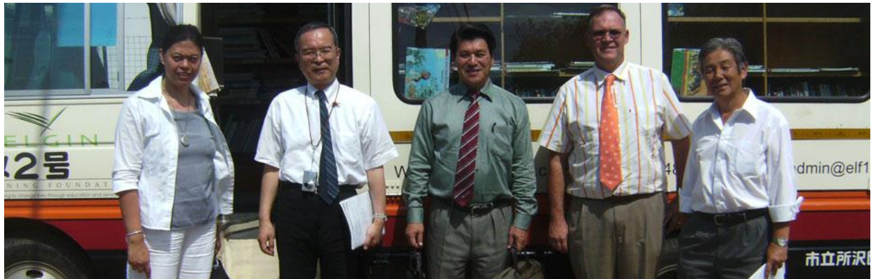
Initial talks between members of SAPESi and OED in 2008.