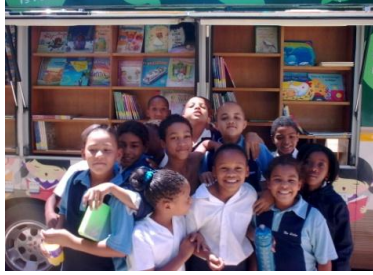
Smiling faces of eager readers at The Glebe Primary School!