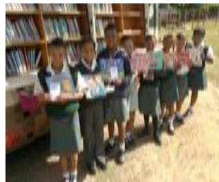
Grade 4 learners at Elandsrivier Primary School are waiting for Vernon to stamp their books.