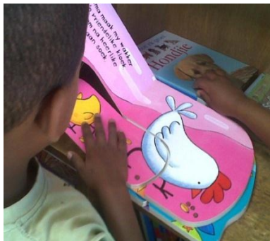
A grade R learner enjoying a cardboard picture book at St John's Primary School