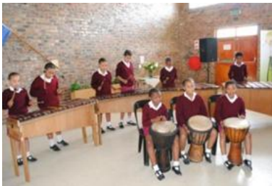
Monteith PS Marimba Band