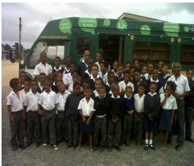
The long wait is over, our library bus is here at last! Jongensklip Primary School