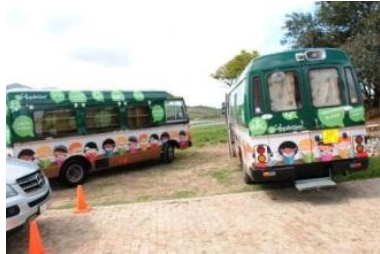
Two of three busses branded by Appletiser